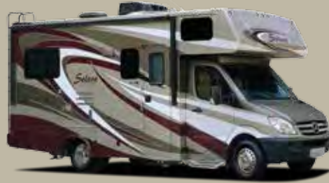
GARNET FULL BODY PAINT