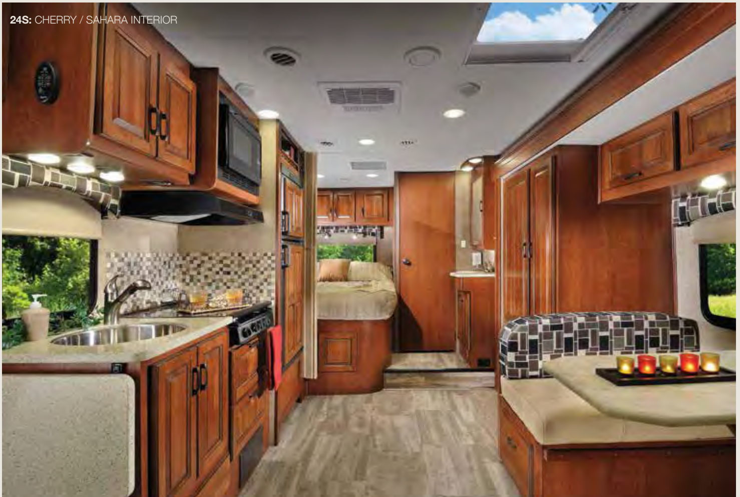
24S: CHERRY / SAHARA INTERIOR