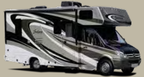
CAPPUCCINO FULL BODY PAINT